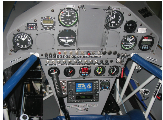
Its cockpit has a Garmin 530 GPS with traffic.