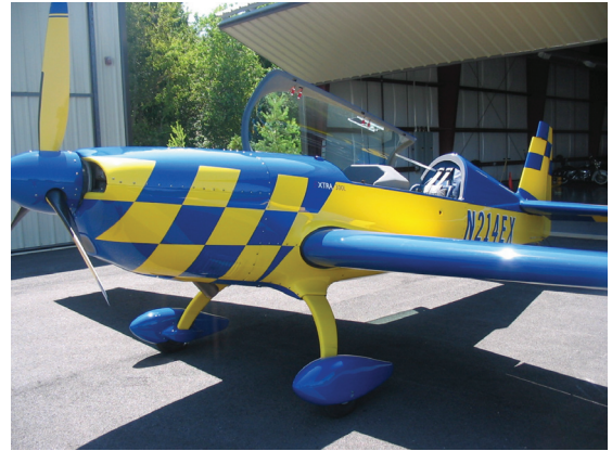
Check out our EXTRA 300L!